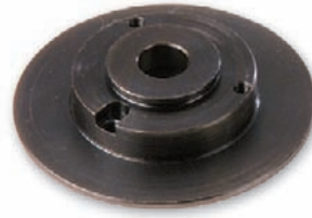
Heavy duty, precision bearing races