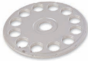
Precision machined, industrial strength aluminum lens dials